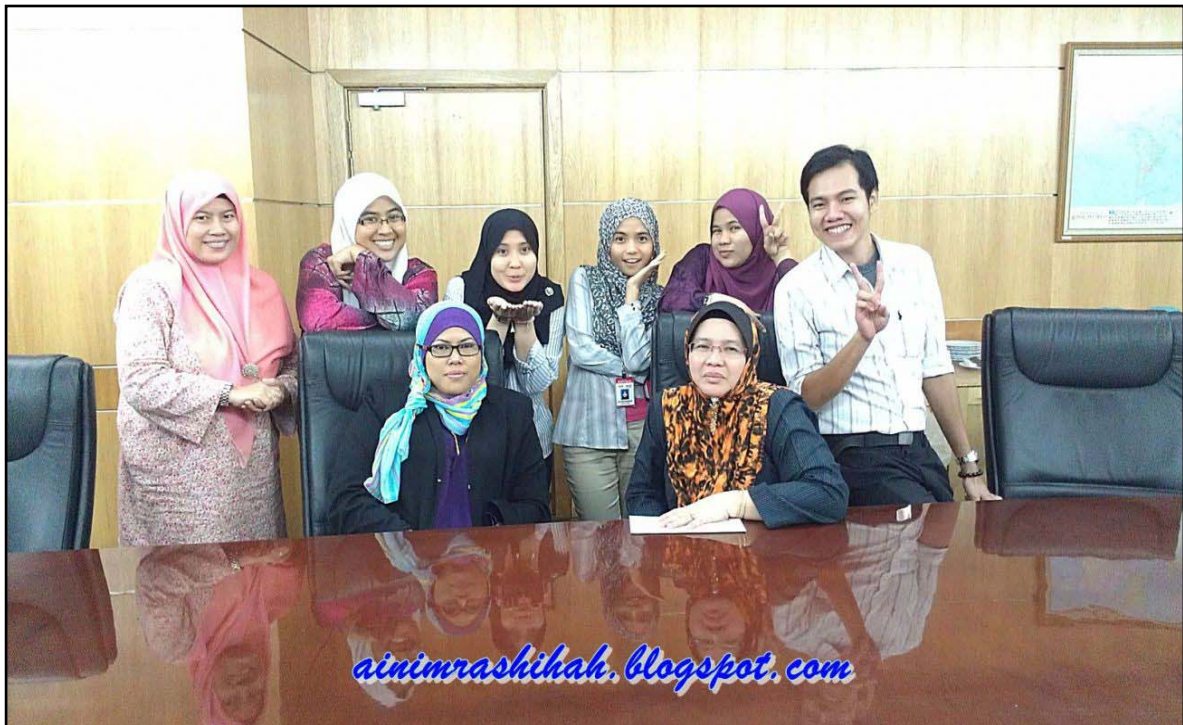
Directing Practice of Supervisor and Counsellor

When taking the role as a counsellor, supervisor assists the counsellor in checking or investigating personal response received by the counsellor on as a result of counsellor – client relationship. This is an evaluation process to measure counsellor's current experience and its effects on his/her work. Then, supervisor functions as someone who supports the counsellor in improving his/her professional development.